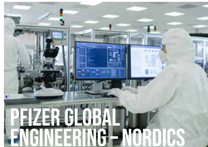
PFIZER GLOBAL ENGINEERING – NORDICS

The Pfizer Global Engineering presence in Helsinki was spread across several locations.