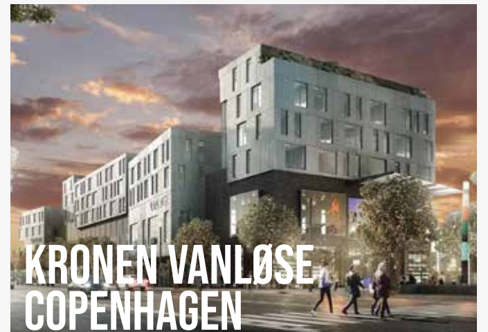
KRONEN VANLØSE COPENHAGEN

Kronen Vanløsen is the new local retail and residential community in the western part of greater Copenhagen.