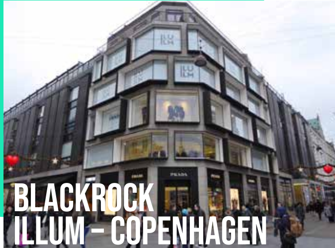
BLACKROCK ILLUM – COPENHAGEN

Illum is the premier department store in Copenhagen, composed of two iconic buildings in the most prominent retail location in central Copenhagen, at the intersection of the two main pedestrian streets.