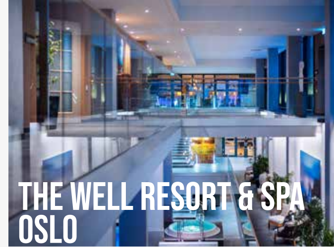
THE WELL RESORT & SPA OSLO

The largest indoor/outdoor spa and bathhouse in the Nordic region.